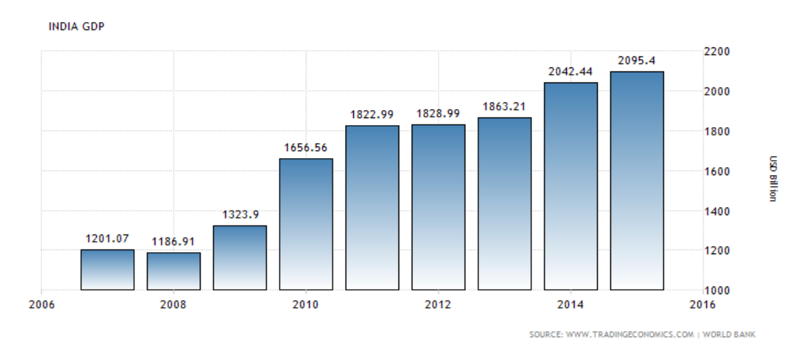
Figure 1. Indian GDP chart from 2006 to 2016

It is clear from the above chart the GDP has shown a drastic growth from 2013 to 2015 and reached to maximum. The main reason for such a growth is "Make in India" Policy that increases FDI inflow and MNCs in India.